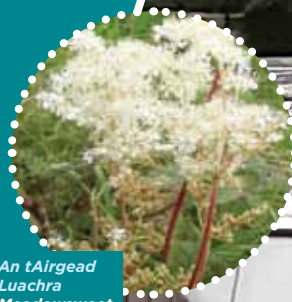
An tAirgead Luachra Meadowsweet